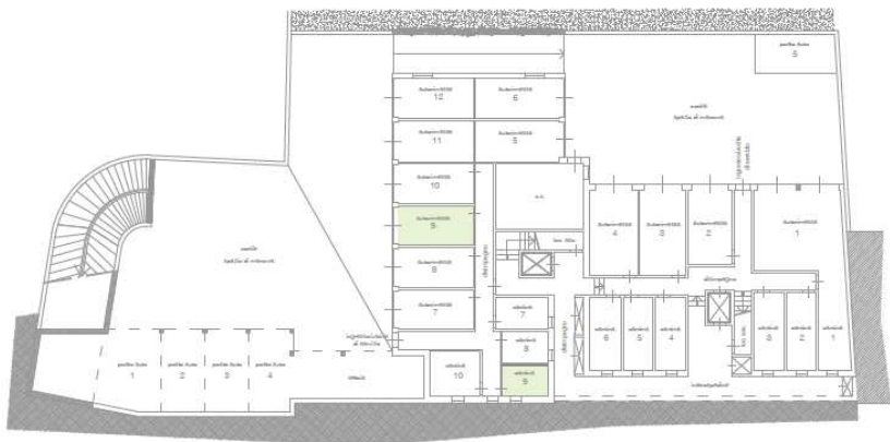
PIANTA PIANO SEMINTERRATO