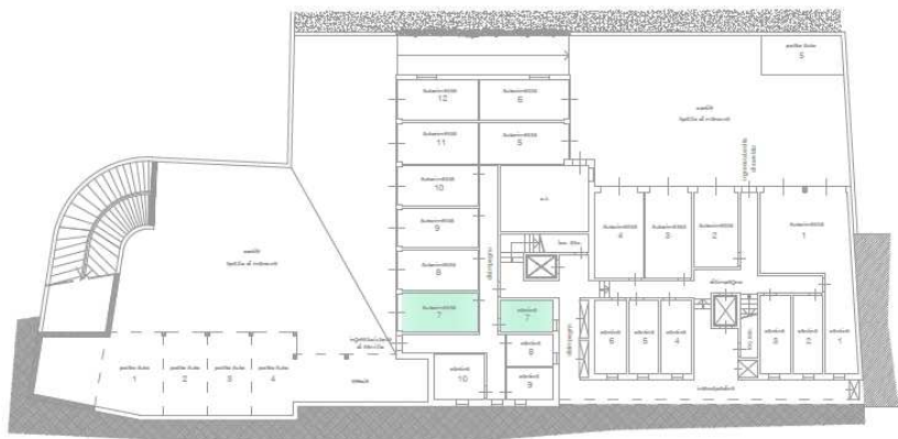
PIANTA PIANO SEMINTERRATO